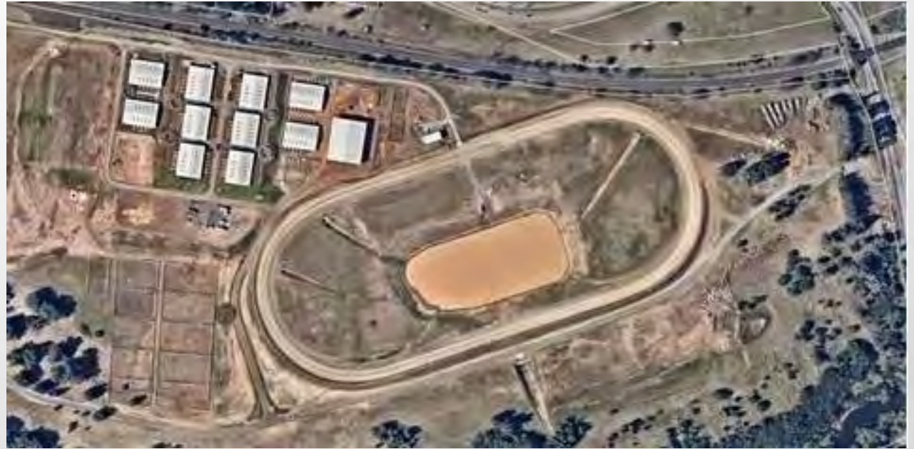
MENANGLE PARK TRAINING CENTRE