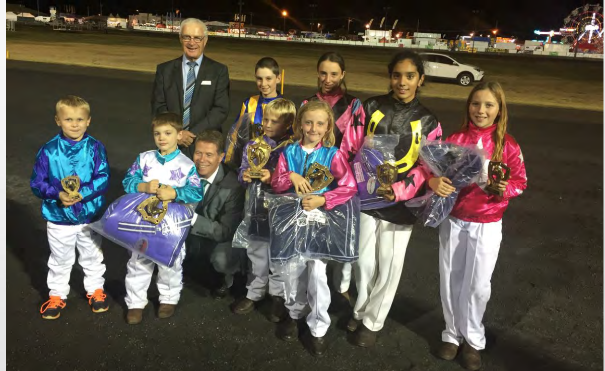
DUBBO MINI TROTS 2016